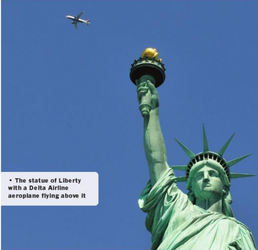
• The statue of Liberty with a Delta Airline aeroplane flying above it

Delta has remained committed to serving Ghana through health crisis from COVID-19 to SARS and outbreaks of the Ebola virus, taking steps to keep