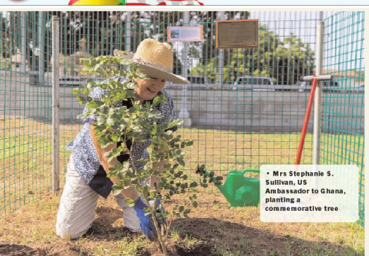
• Mrs Stephanie S. Sullivan, US Ambassador to Ghana, planting a commemorative tree